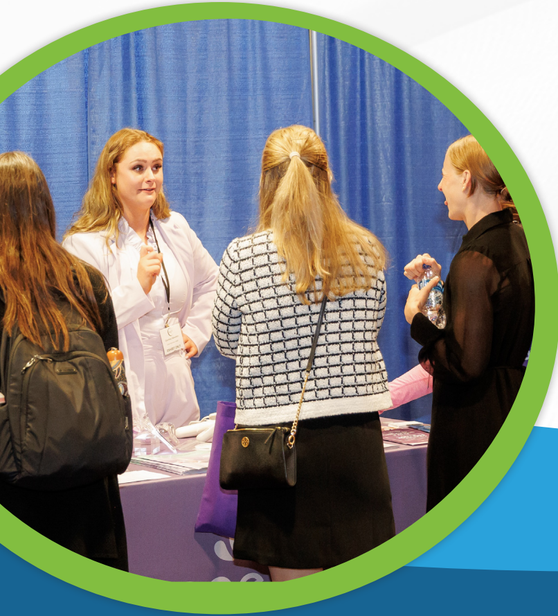
Exhibit Space Includes:

Reserve Your Space Early! Space is Limited