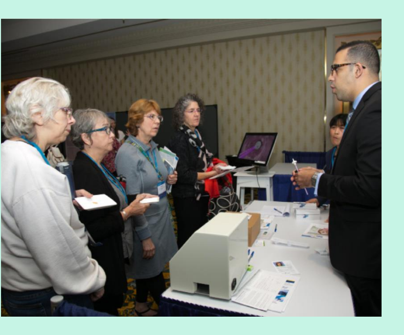
Exhibit Space Includes: