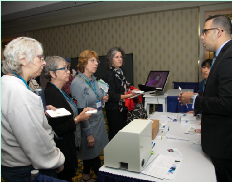
Exhibit Space Includes: