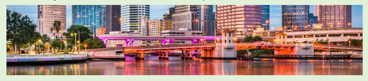
May 2-4, 2024 - New Orleans, LA This is a special course co-located with the ASCCP Scientific Meeting. See <a href="https://www.asccp.org/2024meeting">www.asccp.org/2024meeting</a> for more details.