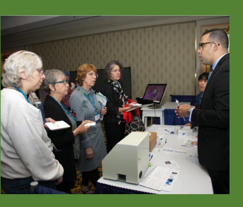
Exhibit Space Includes: