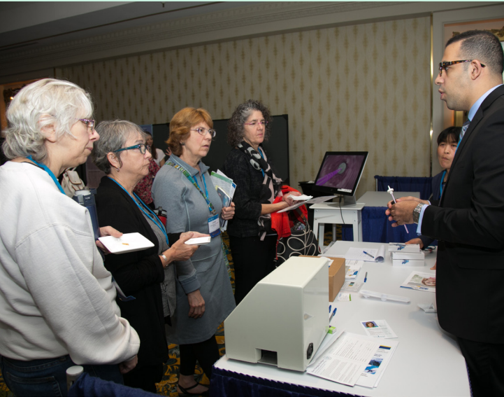
Exhibit Space Includes:

Reserve Your Space Early! Space is Limited