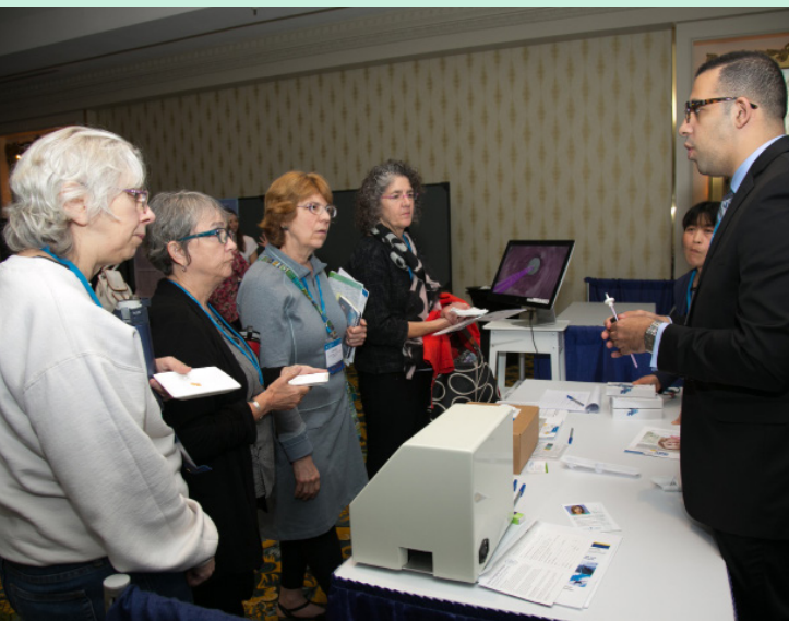
Exhibit Space Includes:

Reserve Your Space Early! Space is Limited