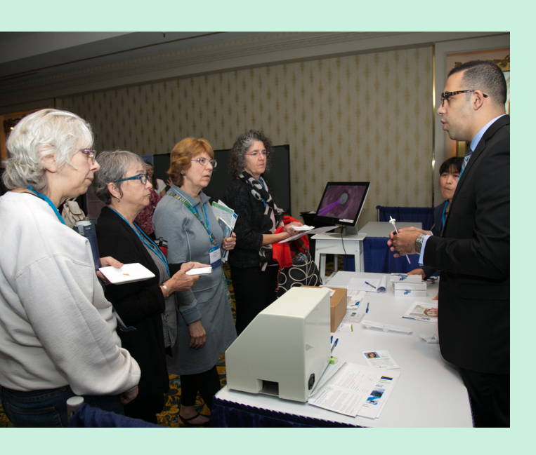
Exhibit Space Includes: