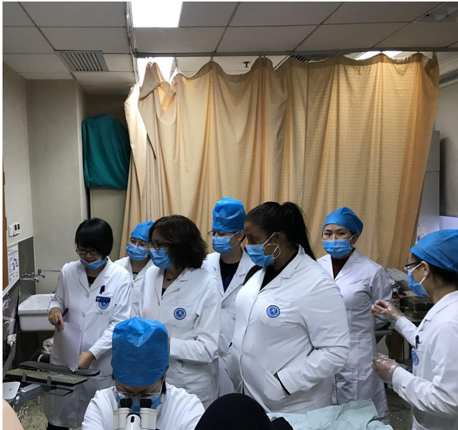
Colposcopy practice and LEEP procedure demonstrations