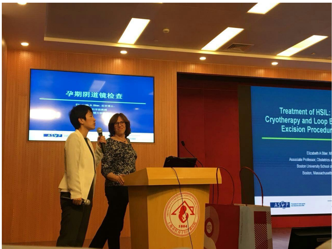
Training course with active discussion and interactions