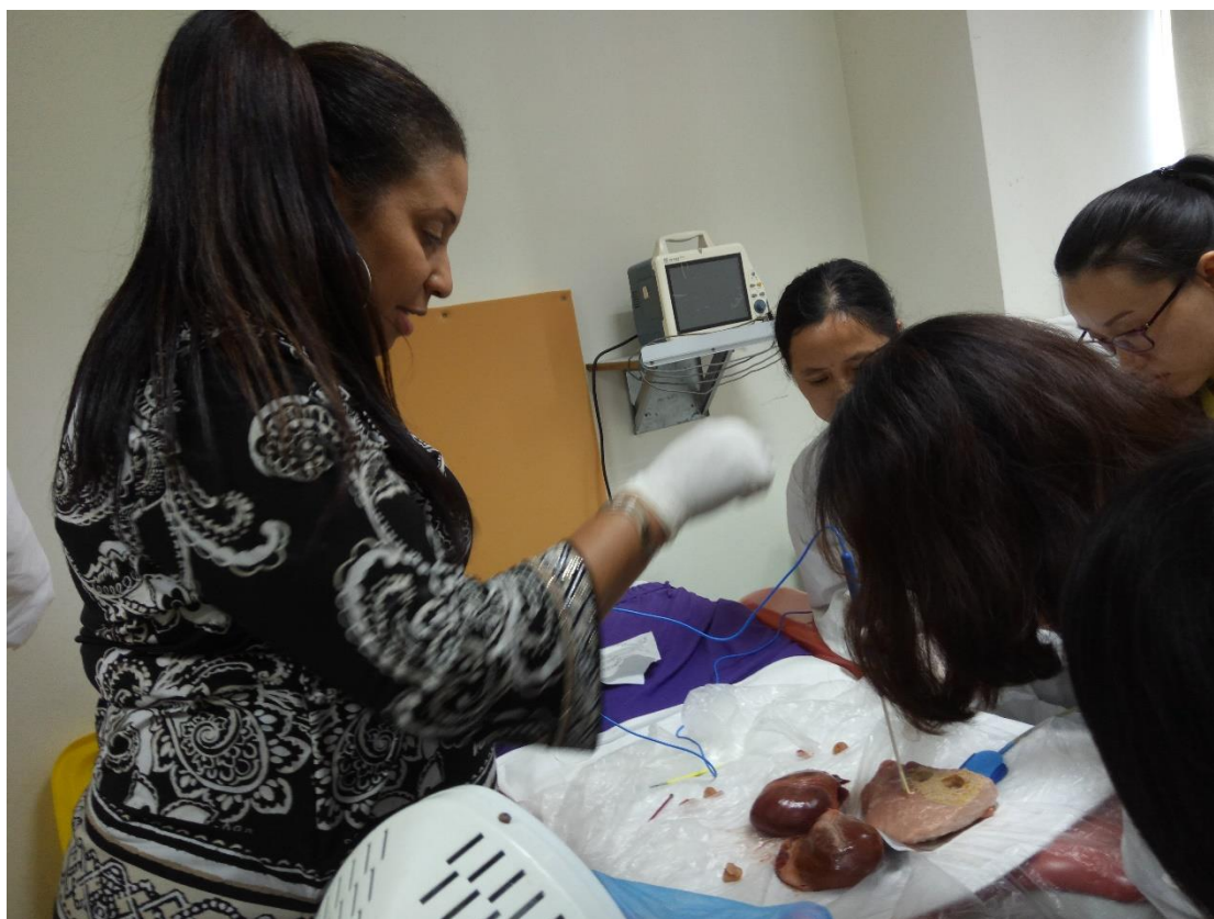
Hands-on training on use of LEEP instruments utilizing porcine tissues