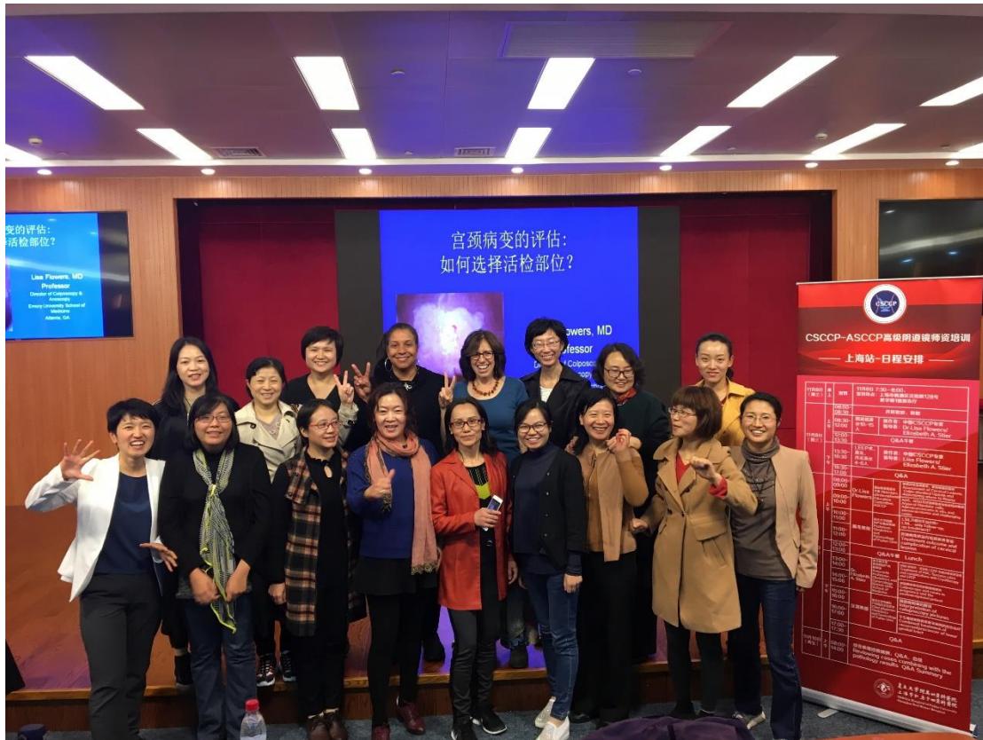
Concluding celebrations following successful training sessions in Shanghai